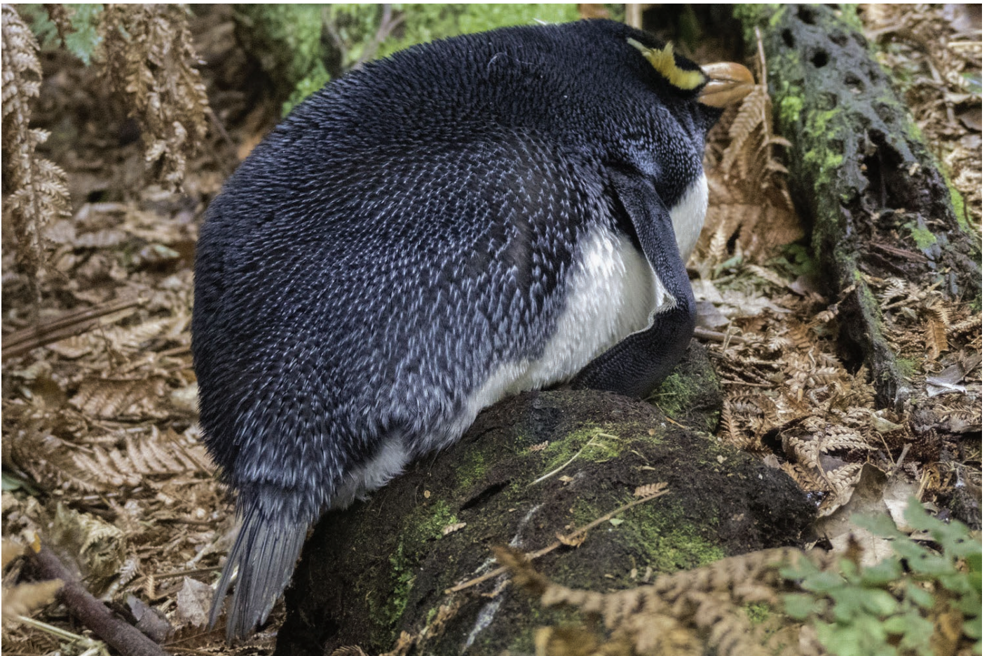
Tawaki fast asleep in the forest of Codfish Island/Whenua Hou