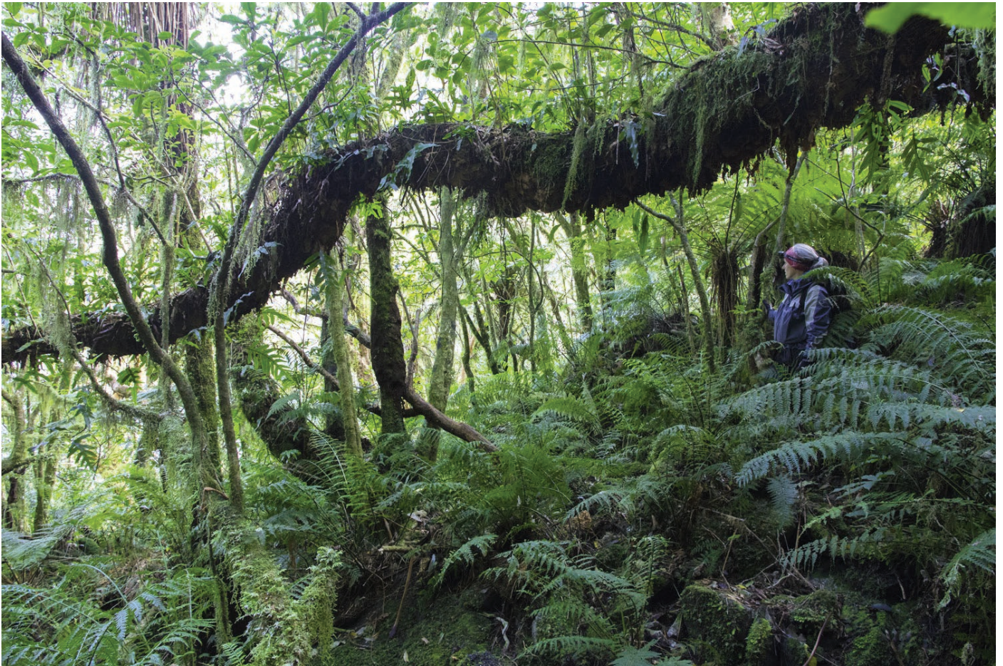
Katta Ludynia searching tawaki nests in Harrison Cove in September 2016.