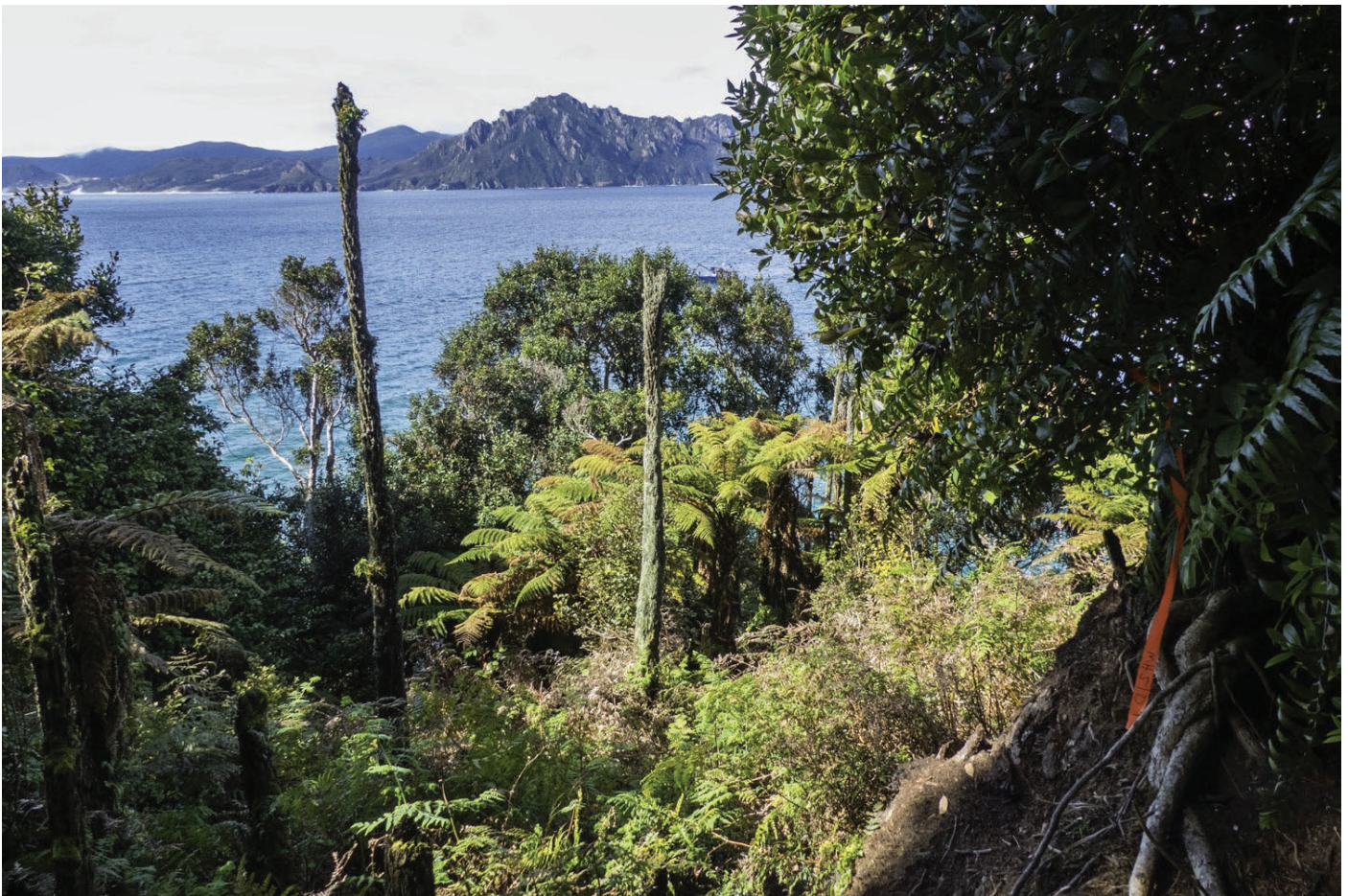
View from a tawaki nest on Whenua Hou with the Rugged Ranges/Stewart Island in the background.