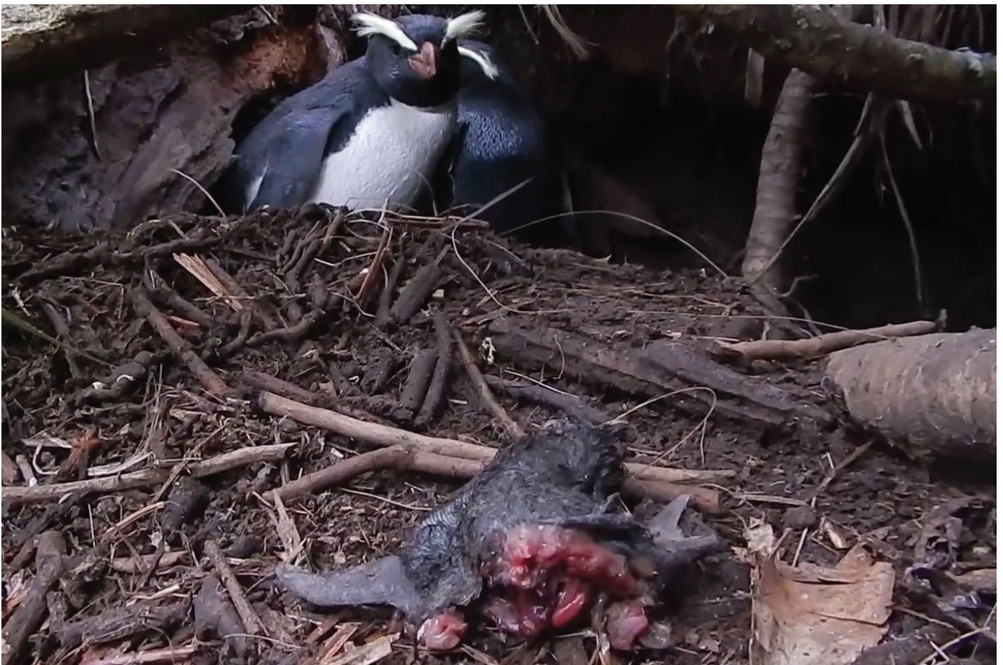
Carcass of a freshly killed tawaki chick its parents attending the now empty nest bowl in the background.