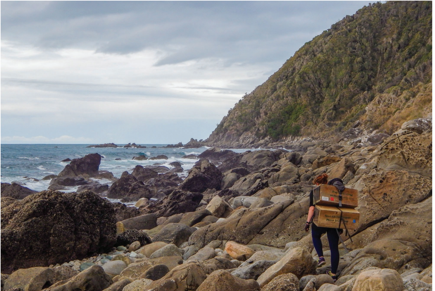
Robin Long carrying fenn traps to the 'Popi's Plaza' tawaki breeding area; a total of four traps were deployed.