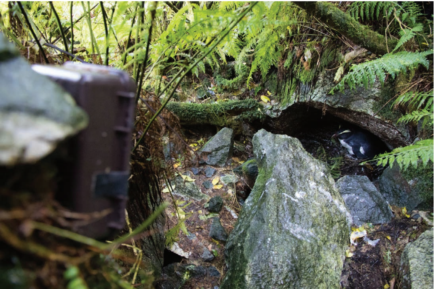
Unusually open tawaki nest in Harrison Cove which made it well suited for time-lapse monitoring using a trail cam.