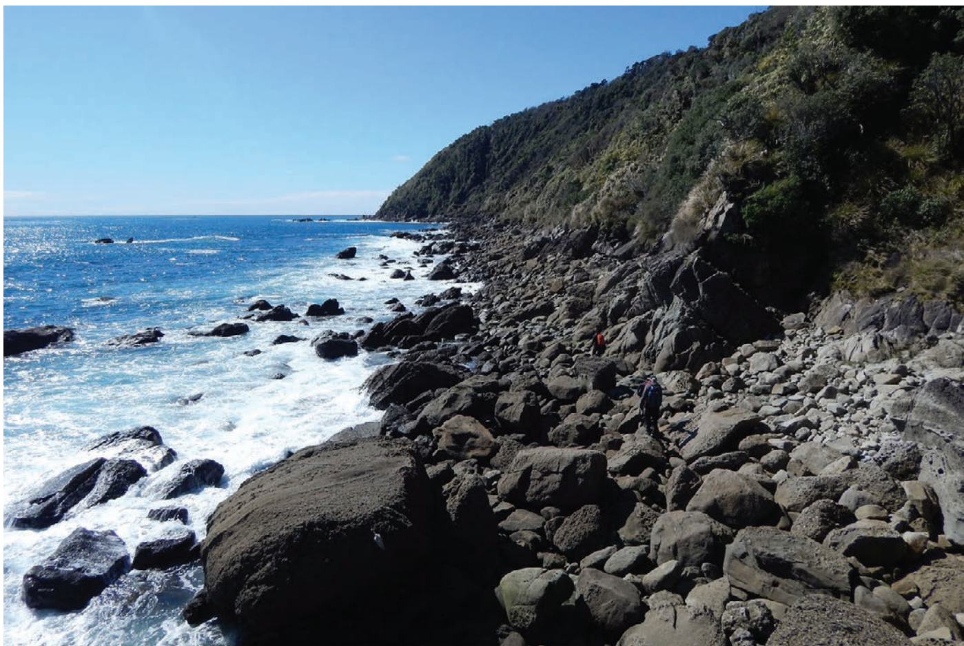
The research team making their way to the Jackson Head study colony in favourable weather conditions.