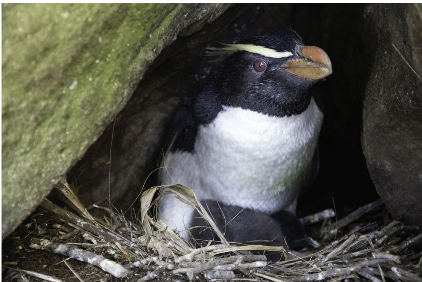
Male tawaki guarding a ca. two week old chick at Jackson Head.