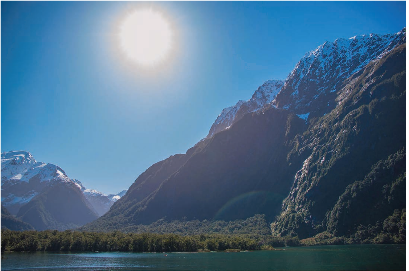
Harrison Cove in Milford Sound / Piopiotahi. The tawaki colony here comprised of 17 active nests in October 2015.